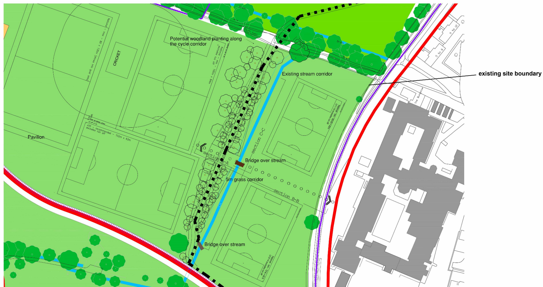
centurion diversion link 1:2000

NOTE: THE PROPERTY OF THIS DRAWING AND DESIGN IS VESTED IN VECTOS (SOUTH) LTD. IT MUST NOT BE COPIED OR REPRODUCED IN ANY WAY WITHOUT THEIR PRIOR WRITTEN CONSENT.