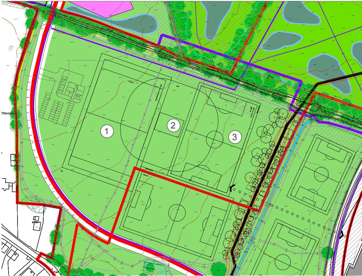
Site Location Plan | 1:2500