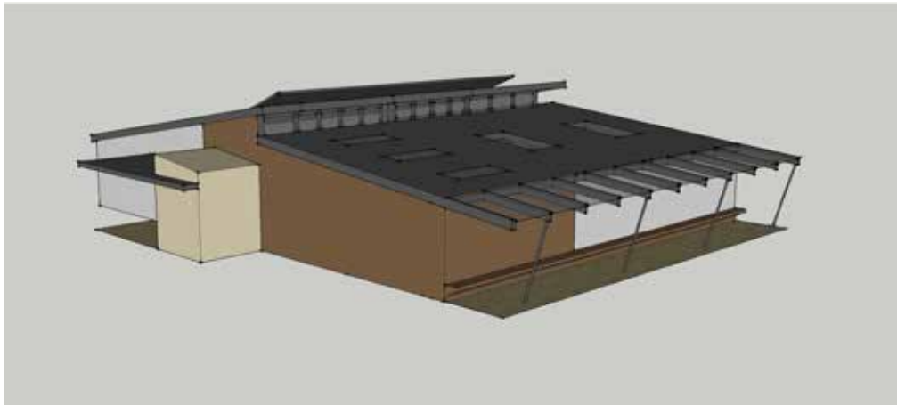
Sketch Model Views