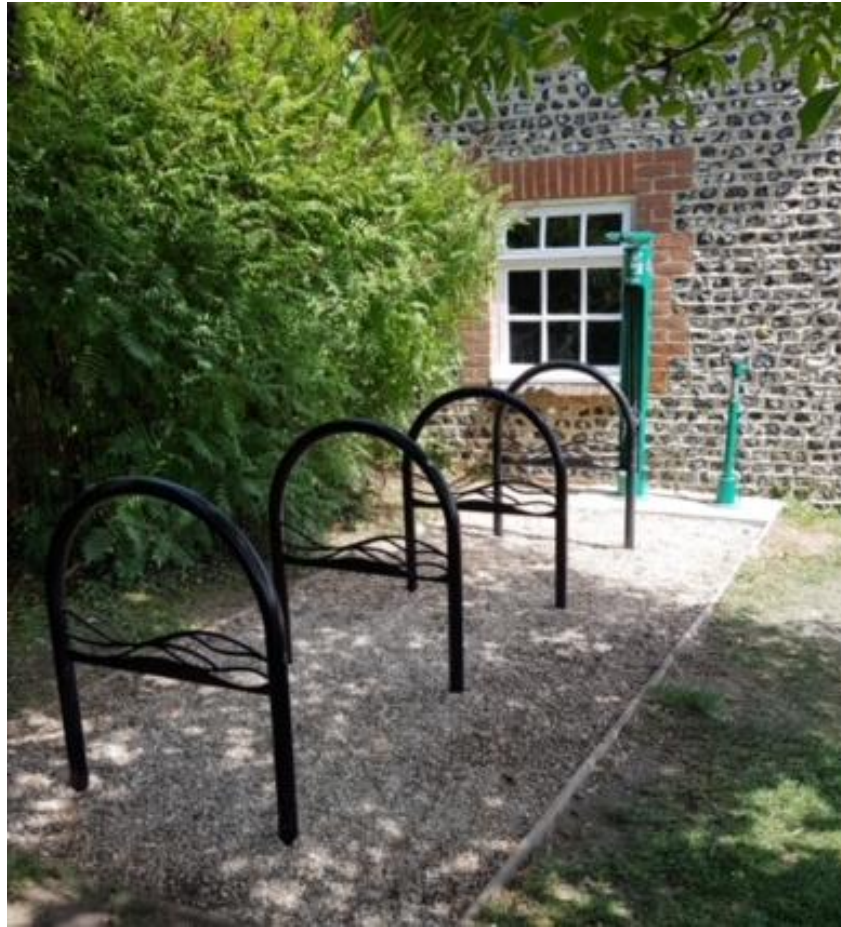
SDNP Cycle parking stands and fix-it station at West Dean Stores and Tea Room